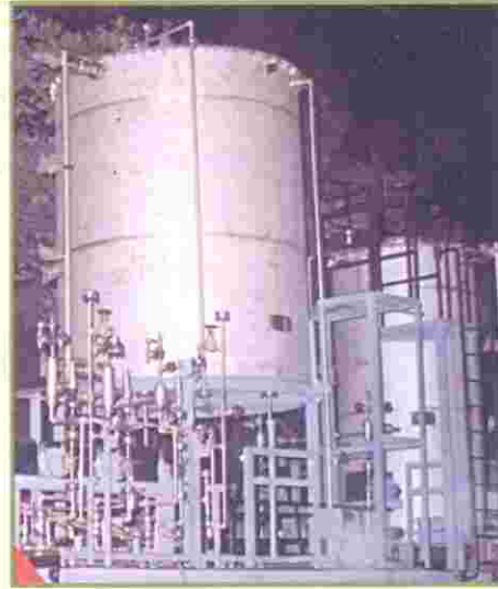
A Multipoint / Multifluid Injection Package for IOCL Panipat