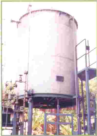
A Sulphide Package to Inject Dimethyl Disulphide.