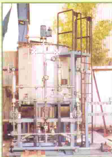
Polyelectrolyte Injection Package.

V.K. Pumps with their associates in U.K. can take up the manufacture of special chemical injection packages, recipe metering packages for the Food/Pharmaceutical and chemical processing industries, from single point injection units to multi fluid packages system.