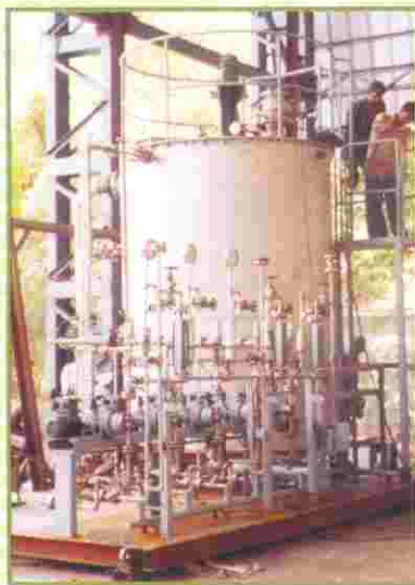
A Sodium Phosphate Injection Package.